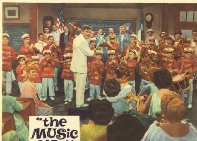
"the MUSIC MAN" Meredith Wilsons ROBERT PRESTON SHARLEY JONES GLENN HAYKOFF HERMINE GINGOLD PAUL FORD TECHNIRAMA TECHNOLOGIK PRESENTED BY WARNER BROS. 6.2 / 171

Reserve a room at the Holiday Inn, 2101 4 th St. SW, Mason City, IA. 641-423-1640. Ask for the Special Toastmasters Rate of $89 for a standard room and $99 for poolside +Tax (subject to availability) Visit: www.holidayinn.com