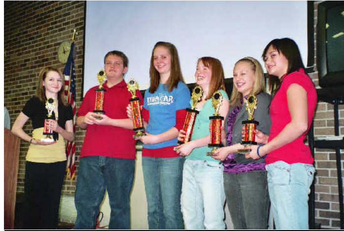
Winners at the Toastmasters Youth Leadership Speech Contest show off their trophies.