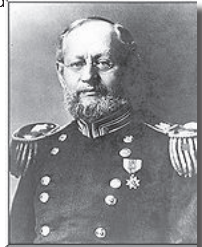
Bob, also known as Henry Martyn Robert, the author of Robert's Rules of Order.

My friends at Five Seasons Parliamentarians want to help other people get to know Bob. If we make parliamentary procedure fun and exciting, then more people will be intrigued and will use Bob.